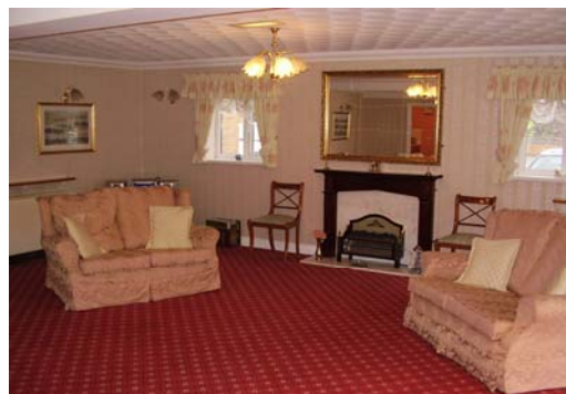
Communal Lounge of Bechers Court