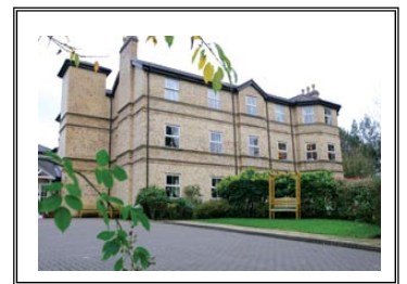
The adjacent Brookview Care Home

Situated adjacent to the BUPA Brookview Care Home, as a resident at the Brookview Apartments, you will be free to enjoy your retirement in the privacy of your own self contained apartment, with the peace of mind that a wide range of extra services and facilities are available to you on request, and need only be paid for if used.