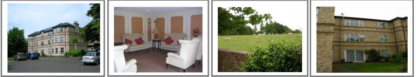
External Images of Brookview, the residents lounge and the farmland to the rear of the development.

Brookview is a pleasant and friendly development set in beautiful and relaxing gardens.