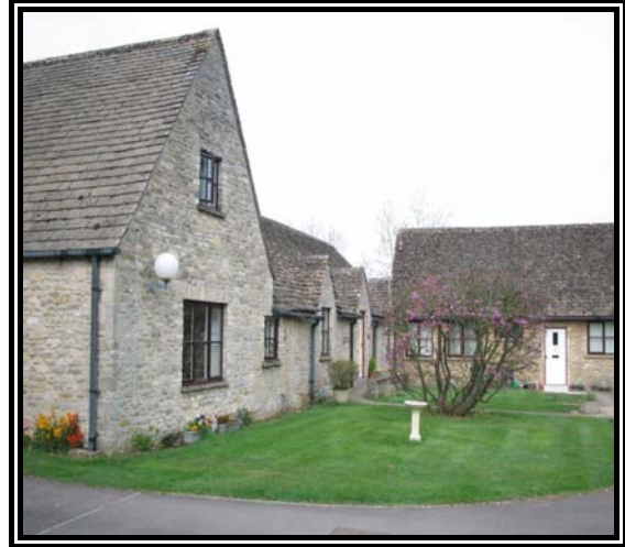
External Images of Ilsom Court Cottages